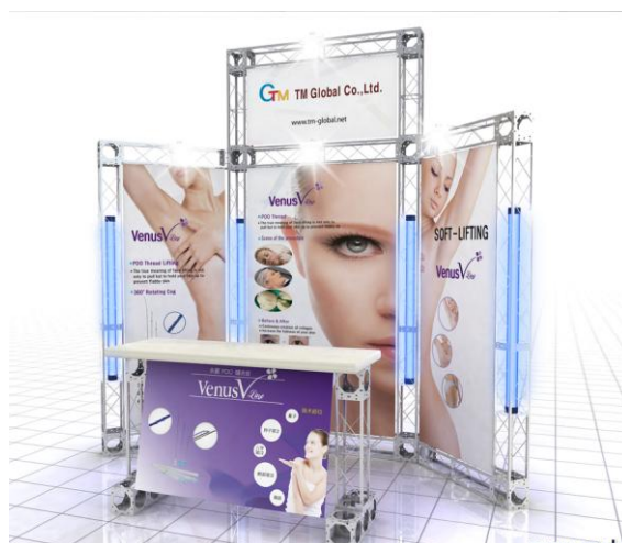
Actual Truss Booth Sample

④ One program book, two coupons for lunch & coffee break everyday